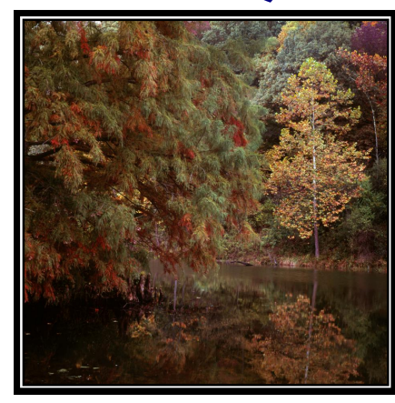
"Cypress and Sycamore" - Kickapoo State Park, IL © 2009

Every fall, I try to go out to shoot the colors of the fall season. This past fall; well, no better way to say it but "it sucked." From October 8<sup>th</sup> until November 14<sup>th</sup>, I tried to go out countless times only to see rain, overcast, and generally less then desirable conditions for taking fall color photos. When the leaves did finally change this season, they dropped within a day or two. I was able to catch this shot early in the fall season at Kickapoo state Park.